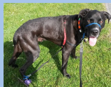
Bow wearing his custom-made harness to help hold his foot up as he leans to walk again