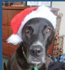
Karen's dog Bow is getting into the festive season.

Signs of heat stress include, excessive panting, laboured breathing, difficulty standing or wobbly walking. If your pet is suffering from heat stress contact the clinic immediately.