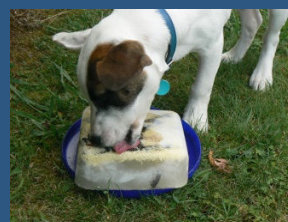
Doggy ice blocks can help keep your dog cool and entertained at the same time.